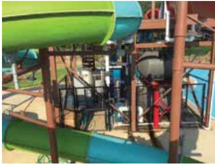
Micron filters: M5000, M4875, M48106 and HRV 36.