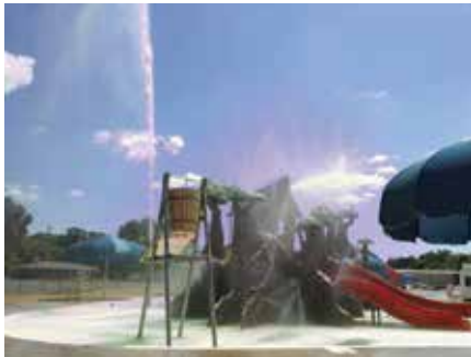
Splash Kingdom, Kids area.